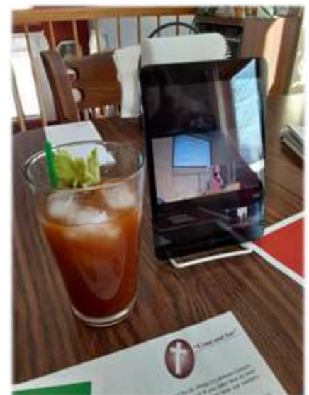
Some members participated in the annual meeting in the comfort of their home