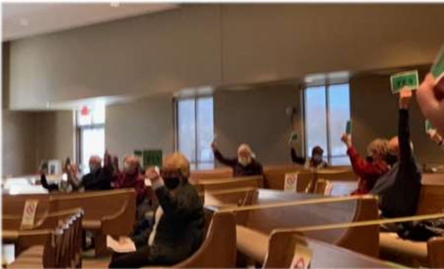
People voting by holding up their yes/no cards