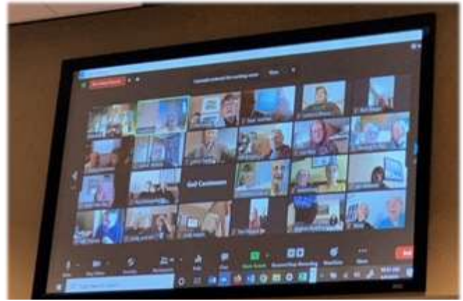
The Zoom screen as seen in the sanctuary