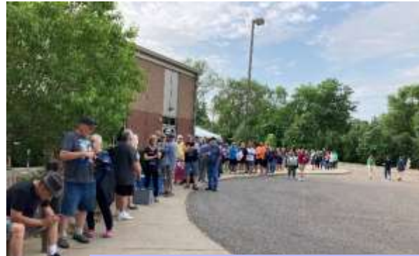
They wrapped around the building, some with bins