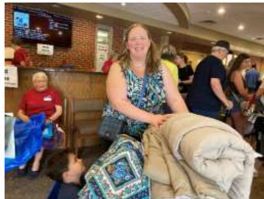
This happy customer and her son know they've found a bargain