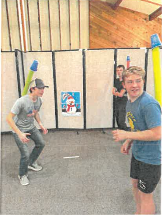
The high school students gathered for our first-ever “Nacho Average Game Night,” and it was a hit! They

Even if you were not a mentor this year, we invite you to join us in this event! There is a sign-up sheet on the kiosk in the Narthex. Anyone attending the event (including students) must sign up as spaces are limited.